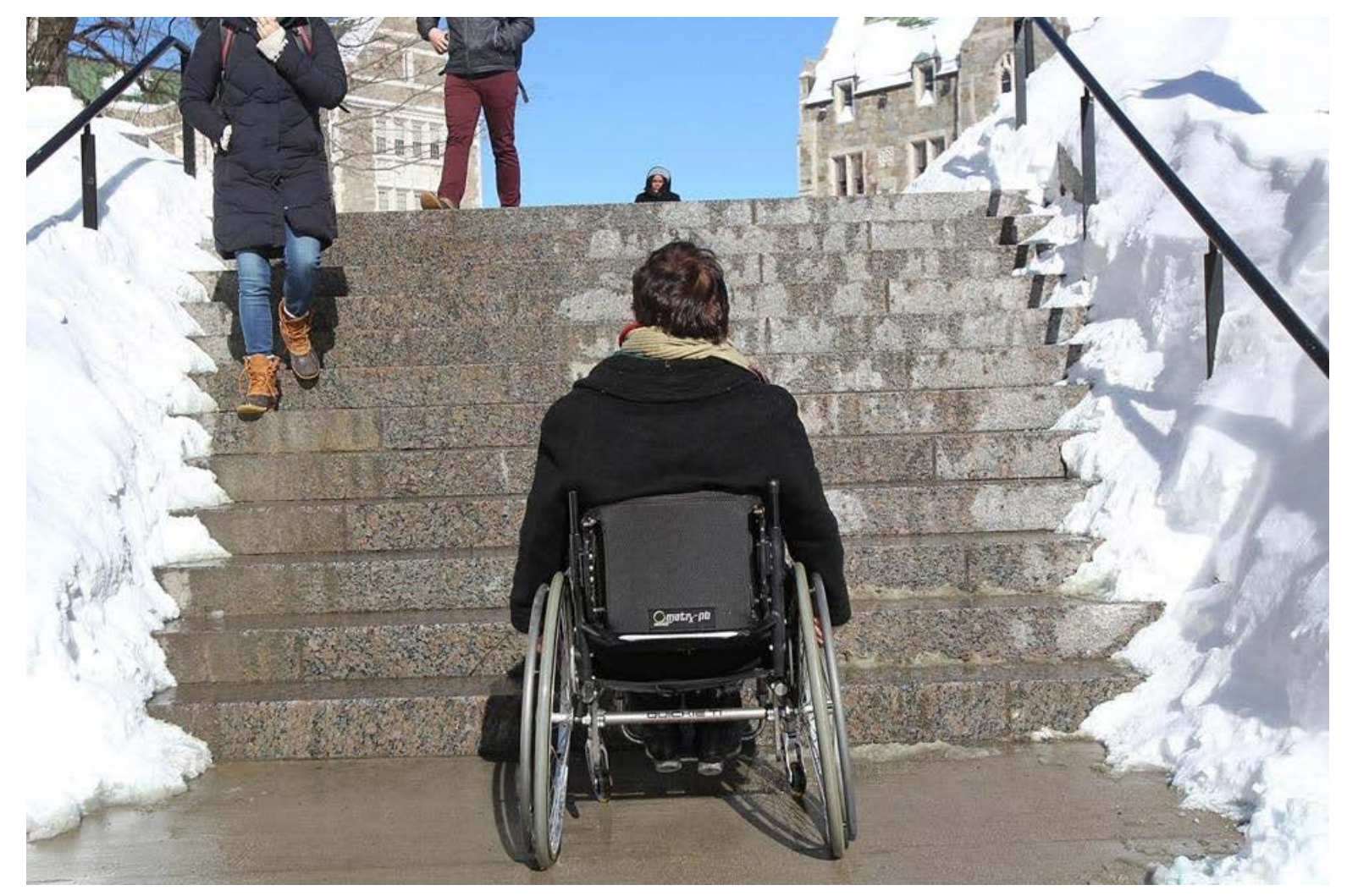
SUZANNE KREITER/GLOBE STAFF

Boston College faces criticism, investigations over accessibility of campus - Metro - The Boston Globe